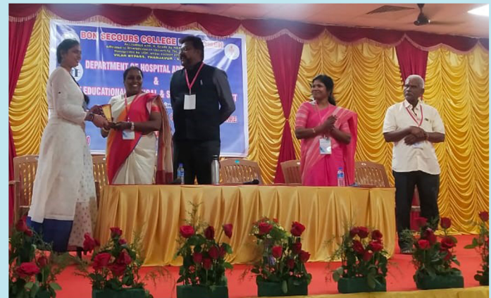
SRFMS students display their co-curricular talents