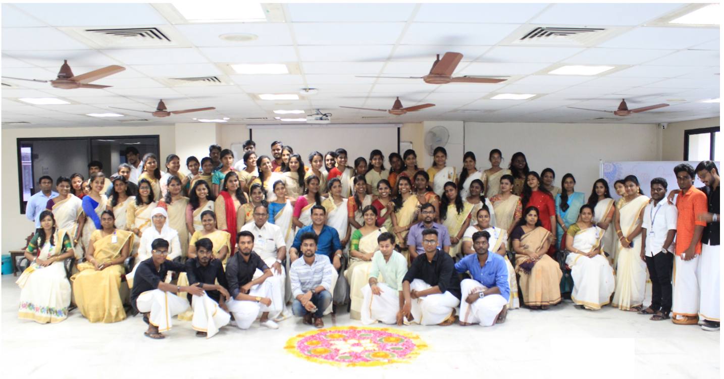
Unity in Diversity – Onam Celebration