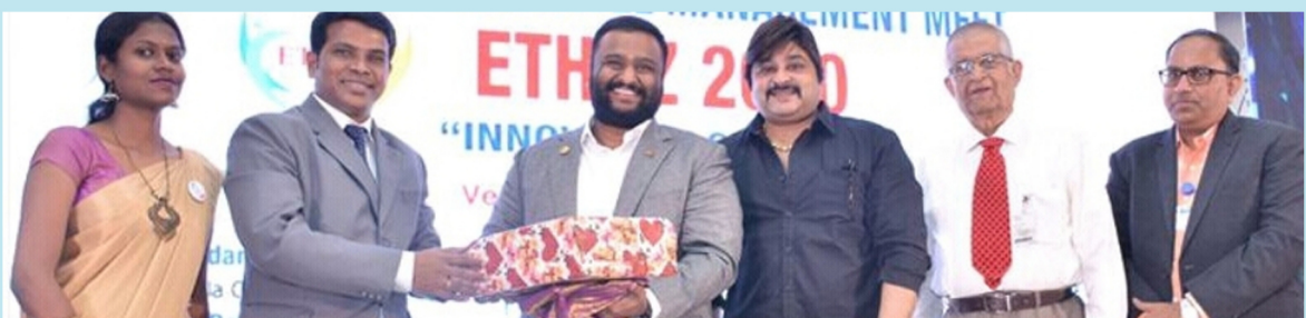
Glimpse of Management Meet 2020