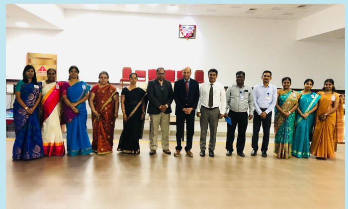
Prof. Vijay Govindarajan visit to SRFMS