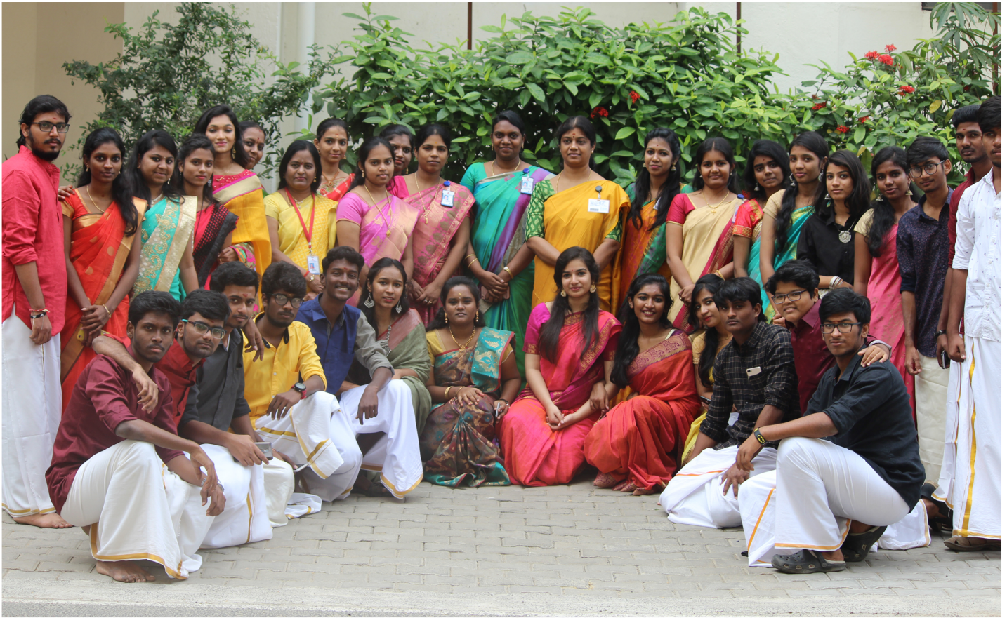
Unity in Diversity – Pongal Celebration