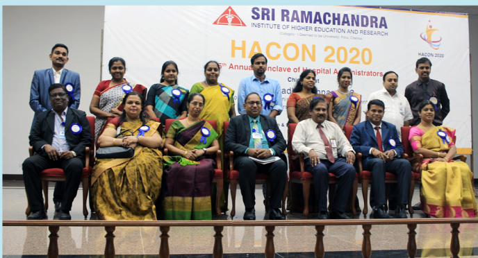
HACON 2020 Team