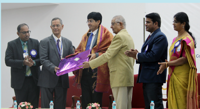
HACON 2020 felicitations