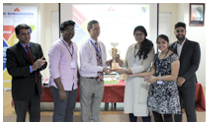
Prize Distribution of Management Meet 2019