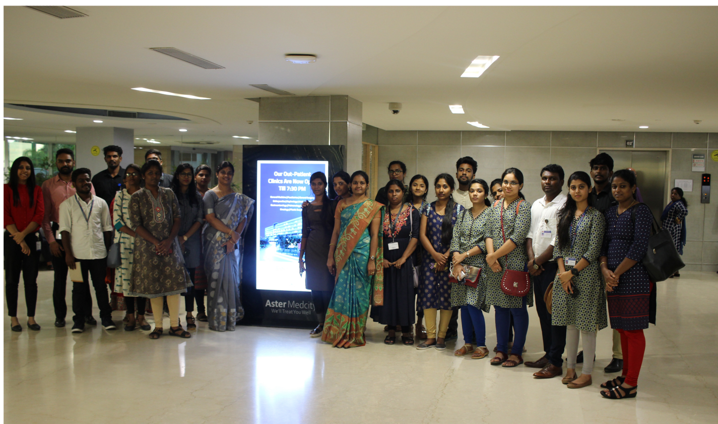
Industry – Institution Interface 2019