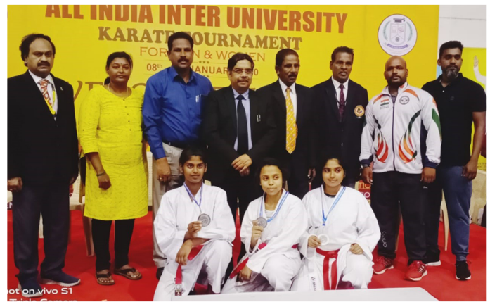
BBA Student achievement in co-curricular activity