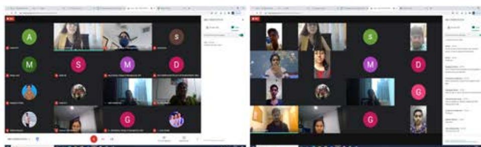
Virtual orientation of BBA Batch 2020-2021